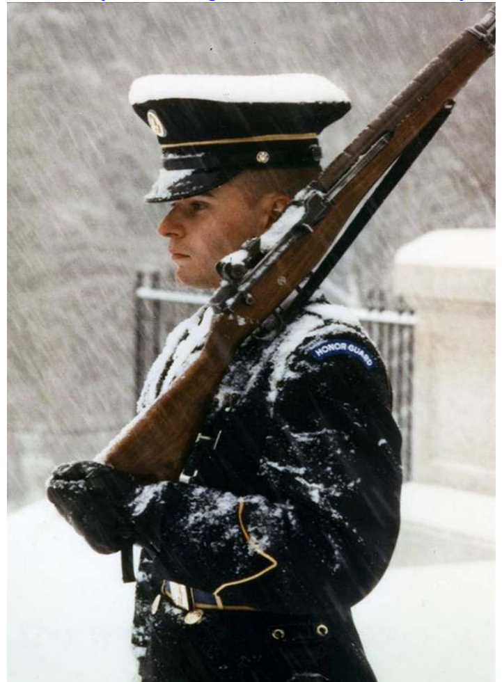
The Tomb of the Unknown Soldier .... While the city of Washington DC literally shut down due to the snow, these men still reported for their assignment; without fail.