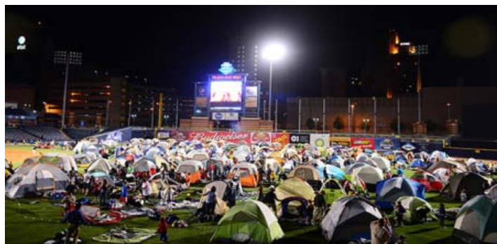
the 2014 Mud Hens Sleepover on 5/3rd Field

Activities included an On Field Parade before the game, meet the mascots, post game fireworks, Scouts can run the bases, a Family (friendly) movie, the sleepover*, an all you can eat breakfast and, of course, the game too!