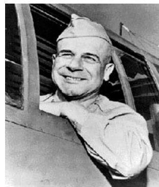
Lt Col James Doolittle

After the US Army Air Forces came into existence, the Army Ground Forces retained the use of light aircraft to support their efforts. In 1947 the Army developed light planes and rotary wing aircraft to support ground operations. Flying the H13 Sioux Helicopter, O-1 Bird Dog airplane all the way to the forming the 1st Cavalry Division (Airmobile) in 1961 to support combat in the Vietnam conflict flying the UH-1 Iroquois (or Huey) helicopters starting in 1964. Today the UH-1 still flies along with many other faster and lighter attack helicopters like the AH64 Apache.