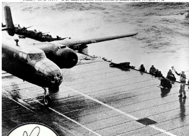
Photo # 80-G-41194 B-25 takes off from USS Hornet to attack Japan, 18 April 1942