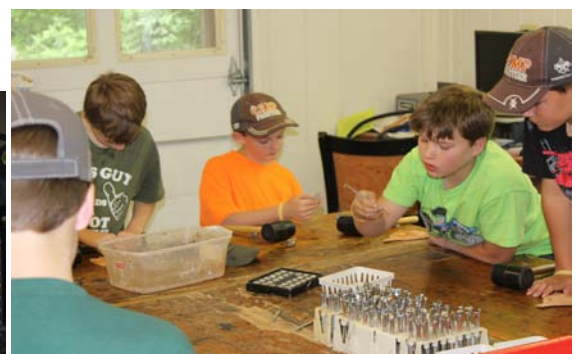
More pictures on our site

It's the fall and we're back in full swing Scouts!