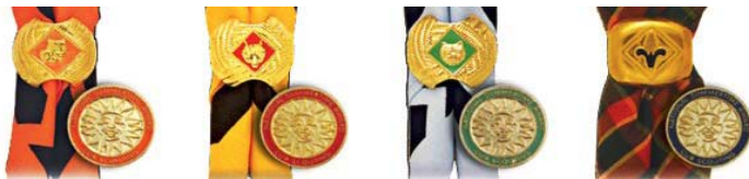
Tiger Cub Wolf Cub Scout Bear Cub Scout Webelos Scout

The National Summertime Award ... Summer is close!