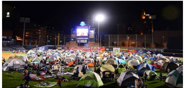
the 2014 Mud Hens Sleepover on 5/3rd Field

Activities included an On Field Parade before the game, meet the mascots, post game fireworks, Scouts can run the bases, a Family (friendly) movie, the sleepover*, an all you can eat breakfast and, of course, the game too!