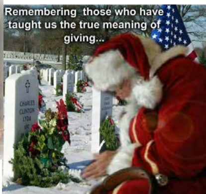
Remembering those who have taught us the true meaning of giving...