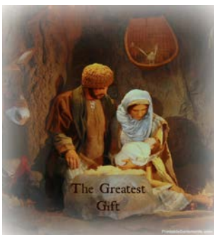
Thinking of those who thought of us first

we'll provide more details when we get them