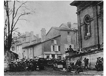
Soldiers of the 353rd Infantry near a church at Stenay, Meuse in France, wait for the end of hostilities. This photo was taken at 10:58 a.m., on November 11, 1918, two minutes before the armistice ending World War I went into effect

World War I – known at the time as “The Great War” - officially ended when the Treaty of Versailles was signed on June 28, 1919, in the Palace of Versailles outside the town of Versailles, France. However, fighting ceased seven months earlier when an armistice, or temporary cessation of hostilities, between the Allied nations and Germany went into effect on the eleventh hour of the eleventh day of the eleventh month. For that reason, November 11, 1918, is generally regarded as the end of “the war to end all wars.”