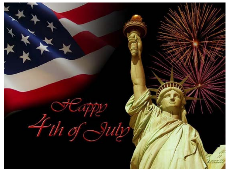
June 14th, 2019