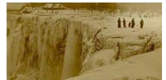
THIS PICTURE WAS TAKEN WHEN NIAGARA FALLS WAS COMPLETELY FROZEN IN THE YEAR 1918. A VERY RARE PHOTO. at head of this but when take the photo before. Remember winter just how COLD and HOW LONG it was that cold