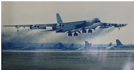
a B-52 Stratofortress Bomber