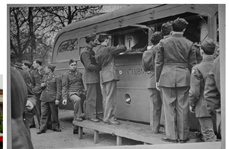
Passing out "free" doughnuts to servicemen during the war...

Please give blood if you can to save lives