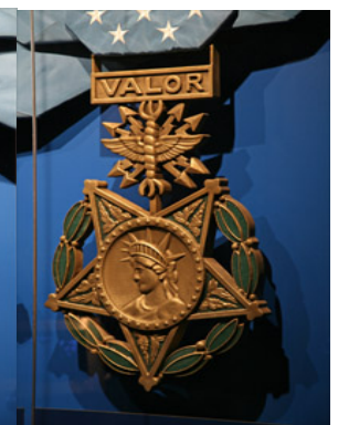
US Air Force