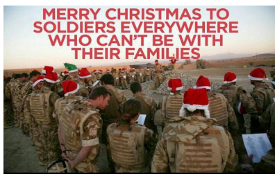
MERRY CHRISTMAS TO SOLDIERS EVERYWHERE WHO CAN'T BE WITH THEIR FAMILIES