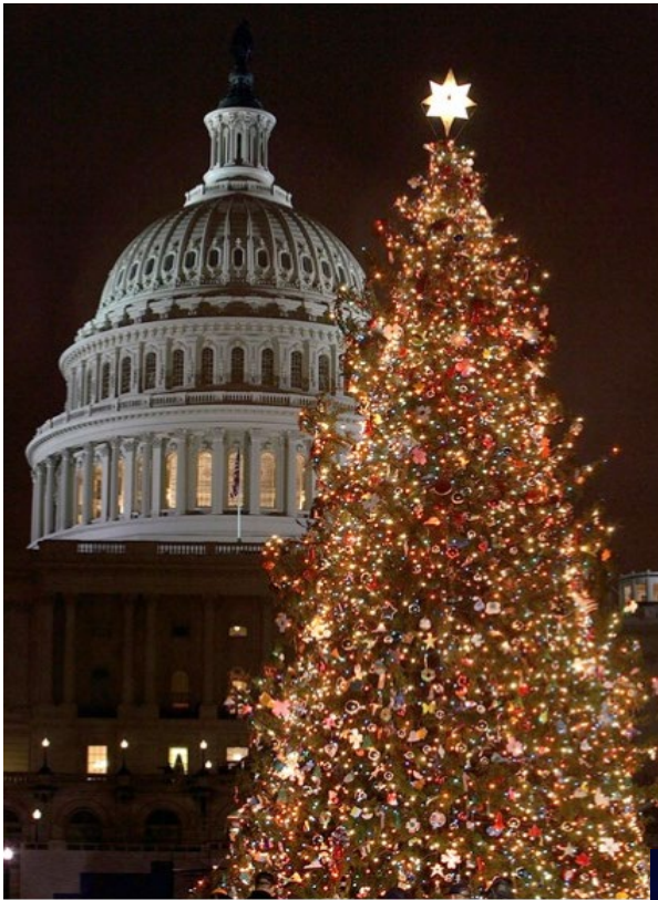
The Capitol Christmas tree in Washington , D.C. , is decorated with 3,000 ornaments that are the handiwork of U.S. schoolchildren. Encircling evergreens in the 'Pathway of Peace' represent the 50 U.S. states.