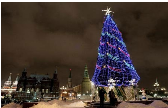
Moscow celebrates Christmas according to the Russian Orthodox calendar on Jan. 7. For weeks beforehand, the city is alive with festivities in anticipation of Father Frost's arrival on his magical troika with the Snow Maiden. He and his helper deliver gifts under the New Year tree, or yolka, which is traditionally a fir.