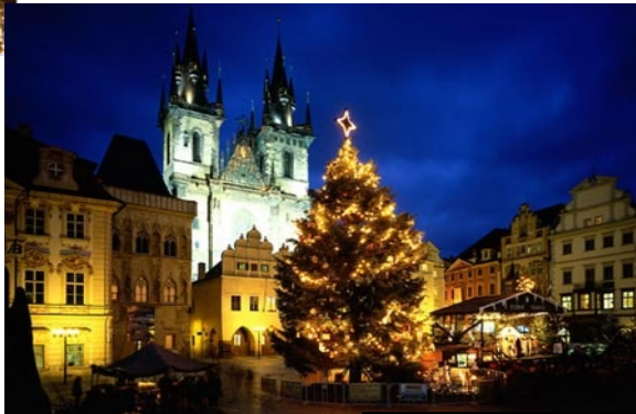
Illuminating the Gothic facades of Prague's Old Town Square, and casting its glow over the manger display of the famous Christmas market, is a grand tree cut in the Sumava mountains in the southern Czech Republic.