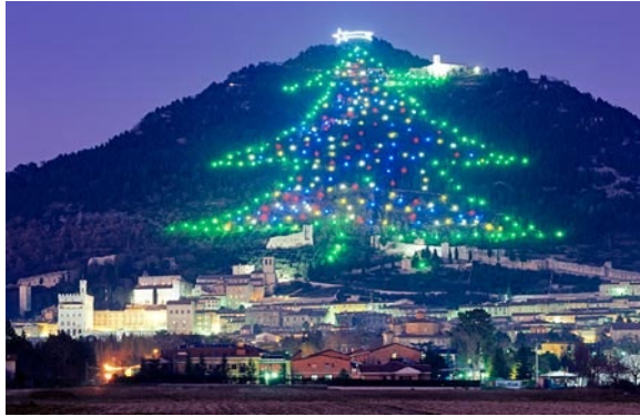
The world's largest Christmas tree display rises up the slopes of Monte Ingino outside of Gubbio, in Italy 's Umbria region. Composed of about 500 lights connected by 40,000 feet of wire, the 'tree' is a modern marvel for an ancient city.