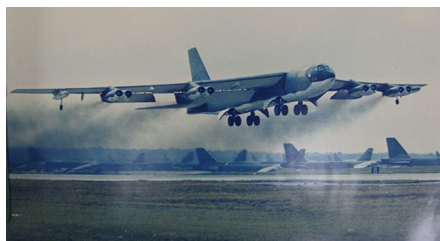
a B-52 Stratofortress Bomber