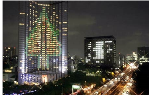
A Christmas tree befitting Tokyo 's nighttime neon display is projected onto the exterior of the Grand Prince Hotel Akasaka.